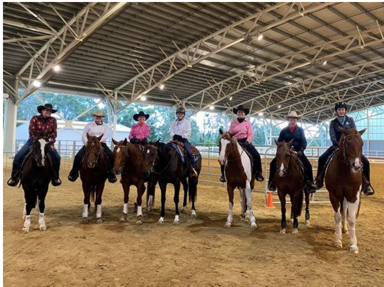
Some of the WDSEQ Members at the WD National Show

The SEQ club followed this up with a Western Dressage Training weekend and open pen at Burpengary on April 30th—May 2nd for all WDSEQ and WDA-AUS members.