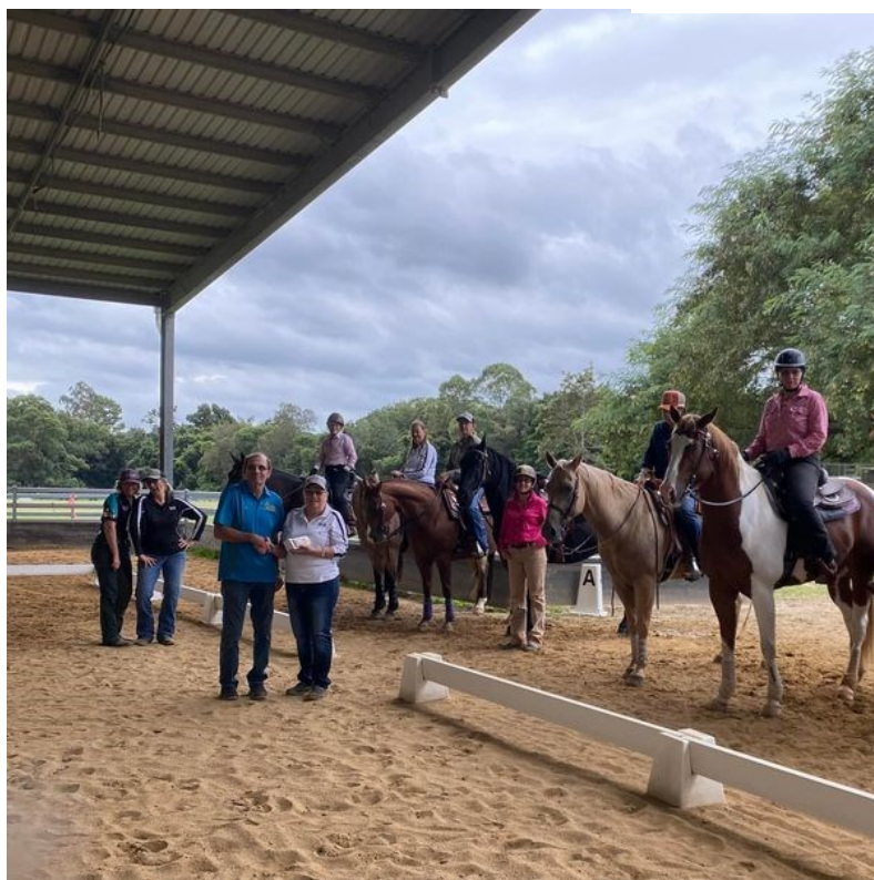
WDSEQ Training Weekend at Burpengary

The WDSEQ are also extremely grateful to the RSL of Australia (Woodford), for supporting the sport of Western Dressage and providing sponsorship by donating Power Packs to enable them to recharge the scoring devices at the arena during a show. These were very much appreciated and will certainly come in very handy at future events. Thank you to the Woodford RSL.